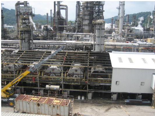
Before picture of the Lube Oil Plant