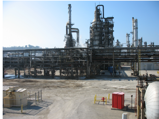
After 1 year of incident free work by Phoenix