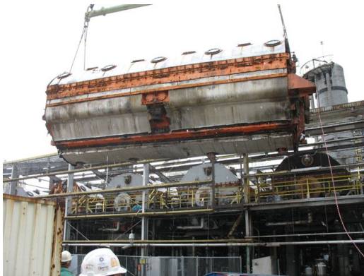
Phoenix sold several 1000 Sq. Ft. Rotary Vacuum Drum Filters, each one weighing over 125,000 lbs for relocation.